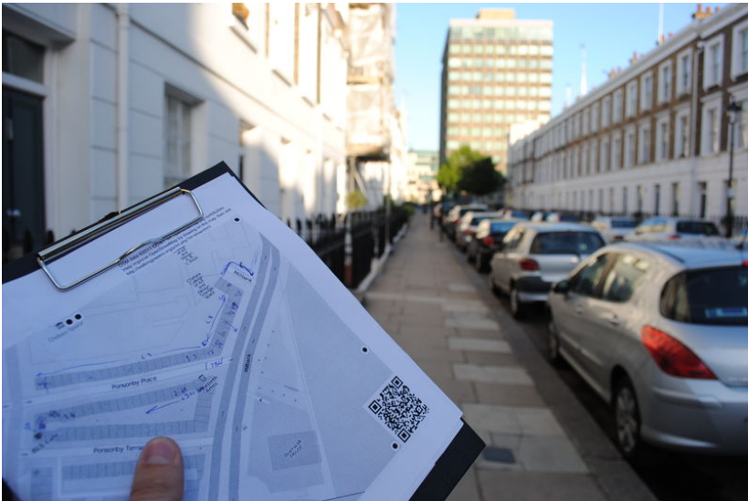
Figure 2 – Walking paper.

To understand the lack of mobilization of the volunteers, it is important to have a clearer idea of what kind of an activity mapping is. OSM is generally presented as a platform where everyone, once registered, should be able to contribute. To take part in drawing the map, one does not need expensive tools: the basic process is to print the area to be mapped on “walking papers” (figure 2) and start listing the items lacking in the public space, whether those items would be buildings and roads, or traffic lights, trees and pedestrian crossings. To help her in her task, one could use a GPS or smartphone, to record geographical position and take pictures of the area.