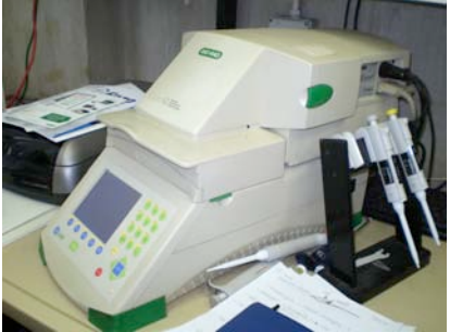
Figure 7 – Margherita and Marta starting PCR